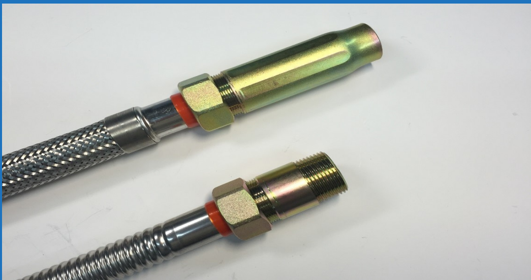
FLEXONE SJ25N-TXXX / FLEXONE SJ25B-TXXX