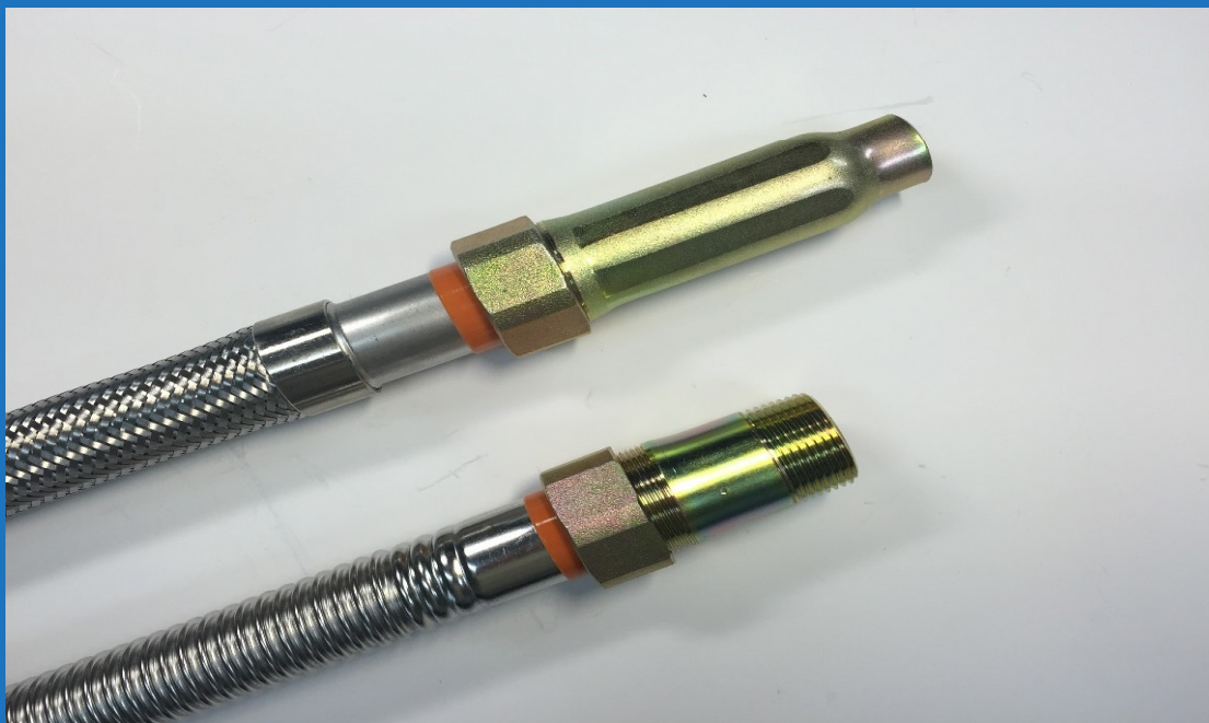
FLEXONE SJ29N-TXXX / FLEXONE SJ29B-TXXX